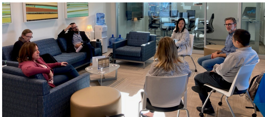
Monthly "On Pedagogy" conversation.

BRYANT FACULTY WHO HAVE COMPLETED THE ACUE YEAR LONG COURSE IN EFFECTIVE COLLEGE INSTRUCTION