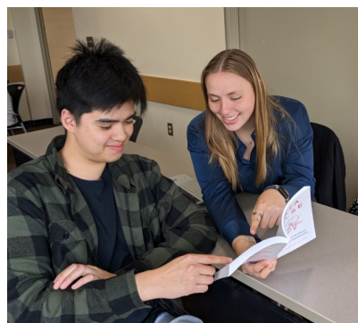
Applied Analytics students discussing AI ethics of book use cases.