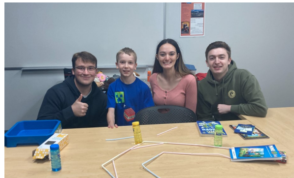
Child Psychopathology students practicing play therapy skills with mini grant-funded supplies.