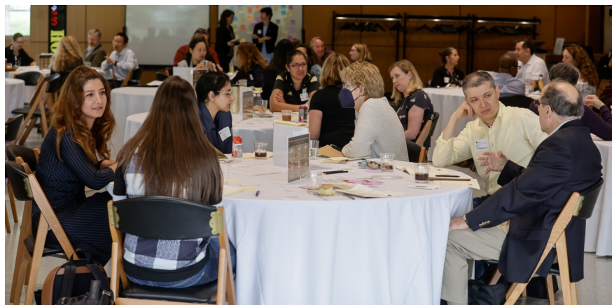
Faculty & staff engaged in discussion at the 2022 Teaching and Learning Summit.